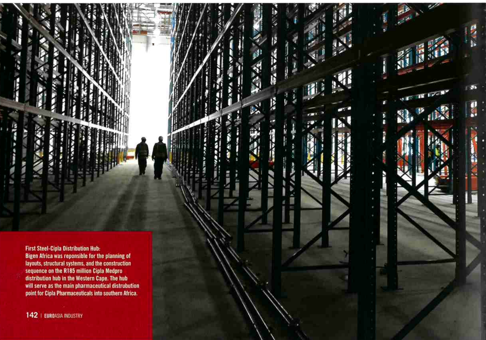
First Steel-Cipla Distribution Hub: Bigen Africa was responsible for the planning of layouts, structural systems, and the construction sequence on the R185 million Cipla Medpro distribution hub in the Western Cape. The hub will serve as the main pharmaceutical distribution point for Cipla Pharmaceuticals into southern Africa.